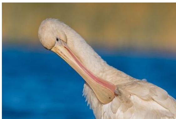
Spoonbill Preening