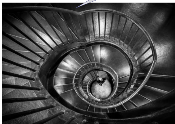
Stairway Frans Hugo