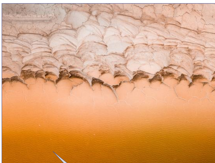
Ballidu by air